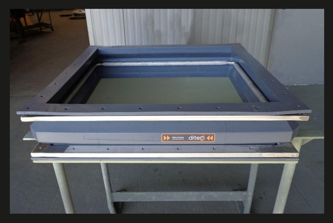
Radiation resistant Silicone single arch rubber bellow with internal vacuum ring prepared for hydraulic testing installation on a high-pressure fan inside of a nuclear power plant