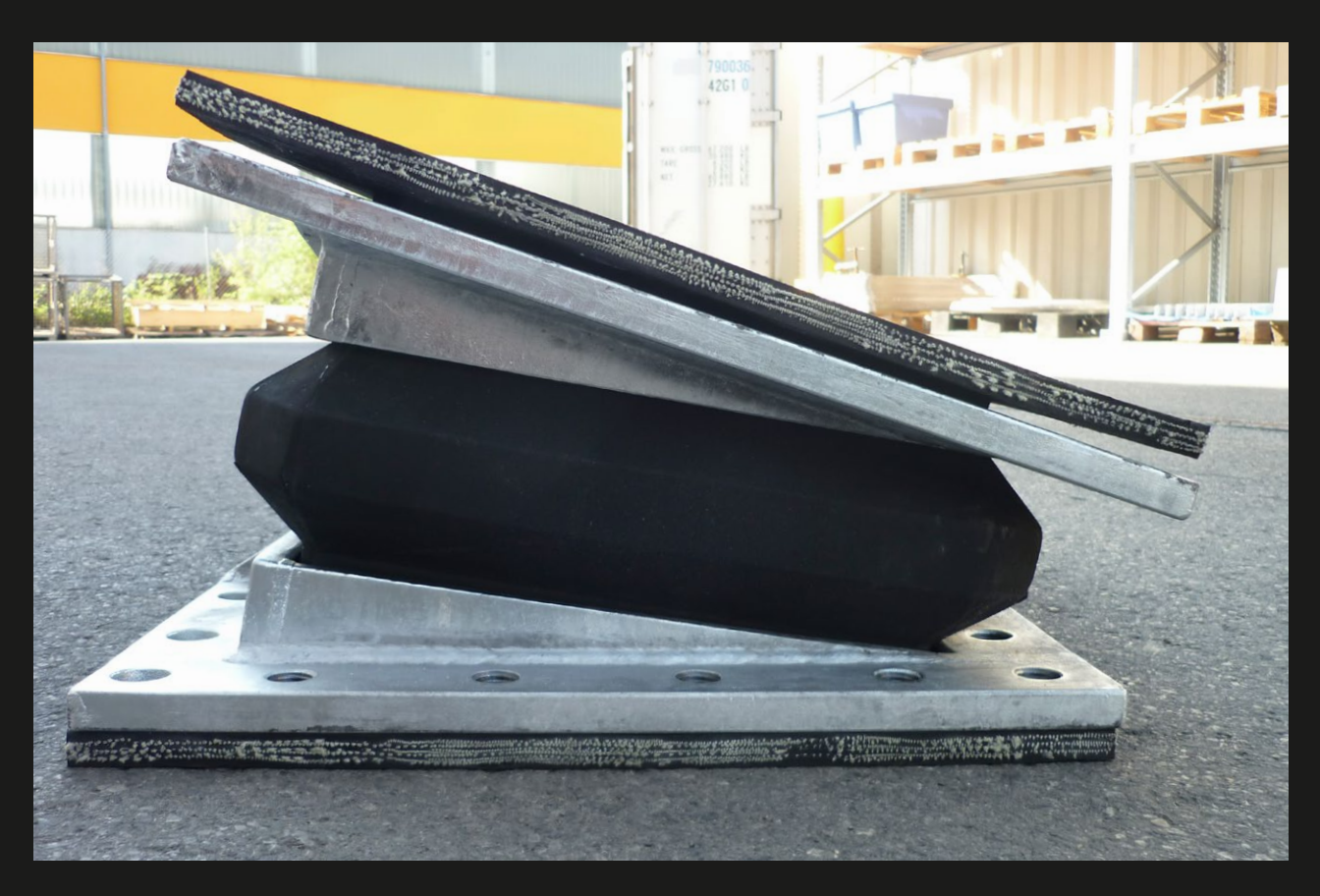
EPDM rubber bellow with angular offset for a coal mill work shop test pressure 15 bar to simulate explosion