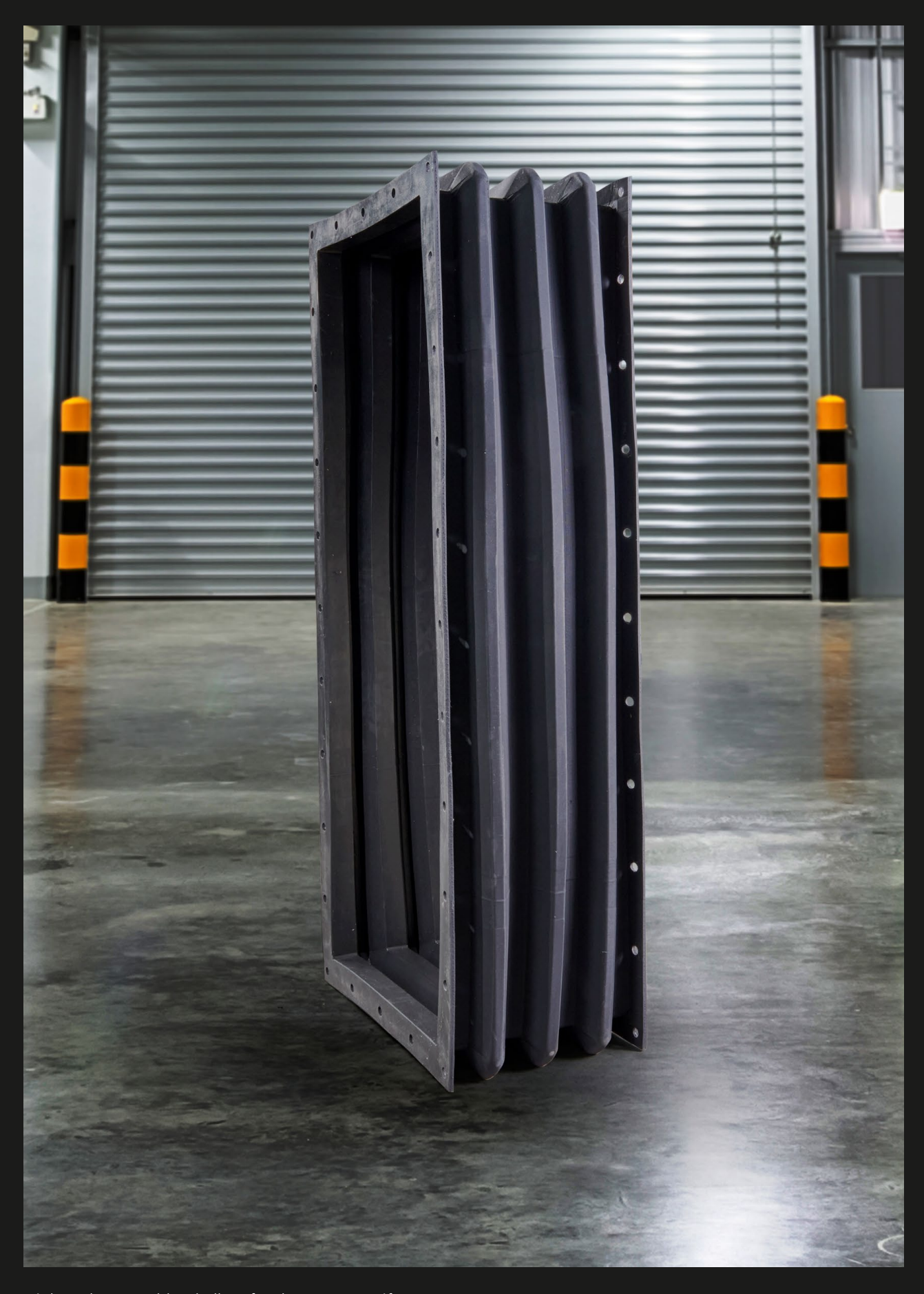
Triple arch FPM rubber bellow for decanter centrifuges